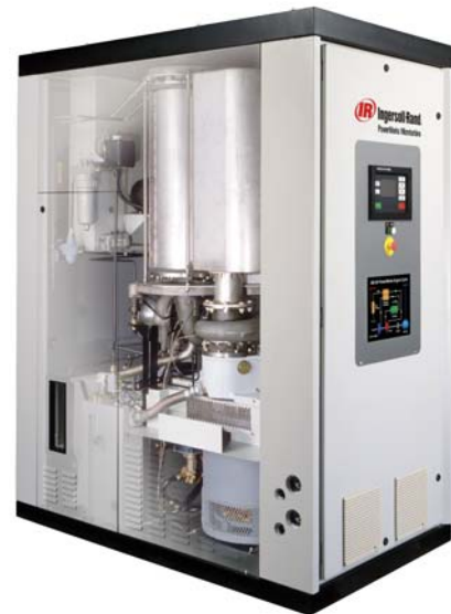
Ingersoll-Rand MT70 features a patented recuperator, dry low NO x combustor and on-board heat recovery (optional).

The turbines use lean premix combustion systems for low NO x and CO emissions (less than 9 parts per million by volume in the turbine exhaust, at an adjusted oxygen content of 15%). Actual turbine exhaust oxygen content is 18%. The turbine engines are recuperated, which results in an efficiency of 29% for the 70 kW unit and 32% for the 250 kW unit (LHV basis, not accounting for the parasitic load of gas compression). Exhaust leaves the recuperator at 450-500°F.