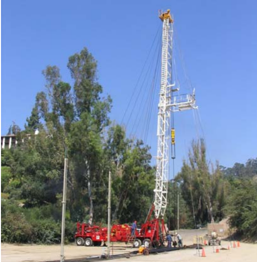
BSI is converting the KOBE hydraulic lift system to HRP's at Sansinena Site 5.

At the same time, BSI is converting the KOBE hydraulic lift system over to HRP's. The net effect will be to increase electrical requirements from 294 kW to 399 kW. The cost of the three microturbines (including installation) is less than $500,000. This equipment should produce 390 kW of the 399 kW required and reduce the annual electrical expense by about $500,000 (payout <1 year).