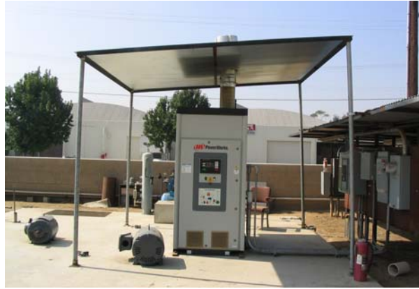
Ingersoll-Rand MT70 operating at the BSI East LA site.

This generates a savings on the monthly power bill of approximately $3,100. The cost of the microturbine was about $75,000. At current electric rates, the system should pay for itself in just over 2 years.