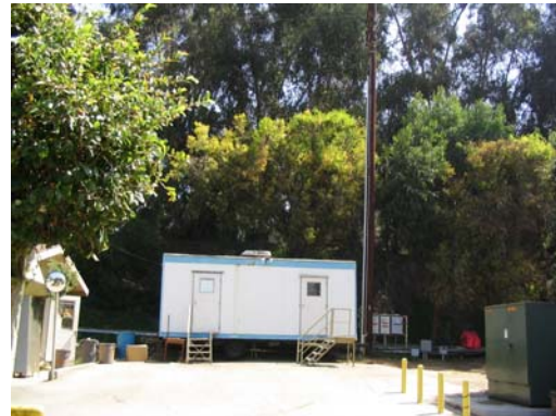
Microturbines will be installed downhill from a residential neighborhood at Sansinena Site 3.